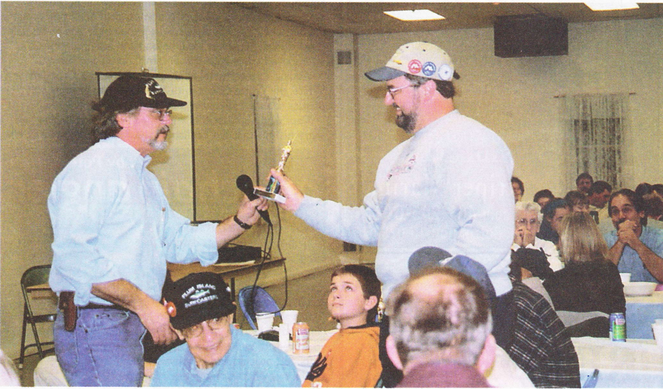
Every November the Plum Island Surfcasters holds the annual awards dinner in which prizes for the year-long tournament are awarded. This event also features a pot-luck dinner where the main entrees are cooked by the club's executive board.

Doors open at 8 a.m. For more information on this event, visit the Plum Island Surfcaster website at www.plumisland.surfcaster.com .